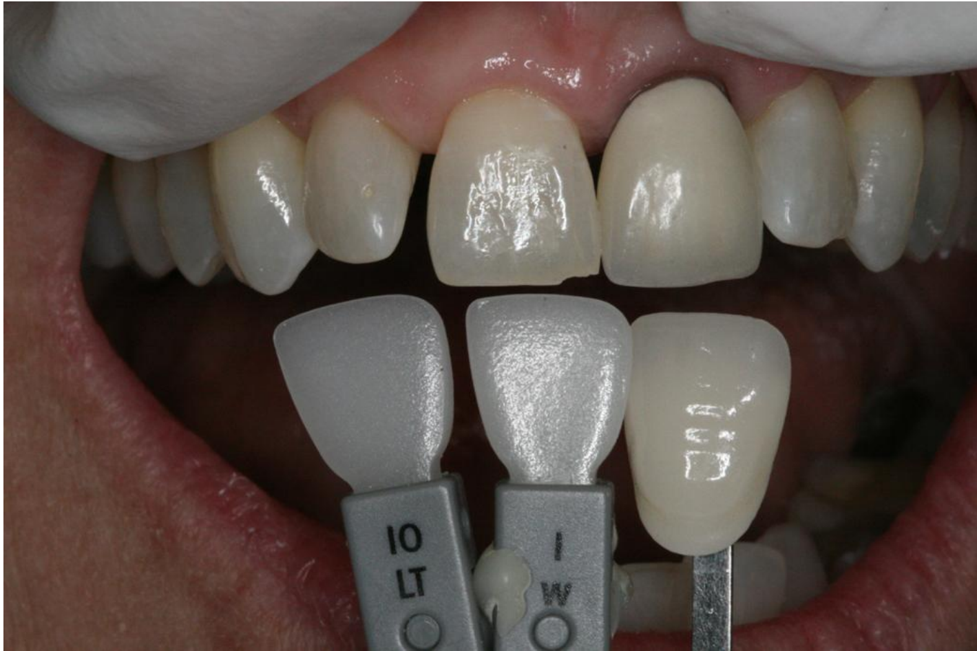
Final Shade with lighter, and darker shade tabs along side desired shade