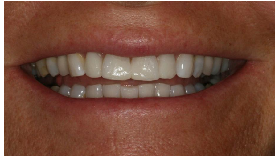
Smile with Temps