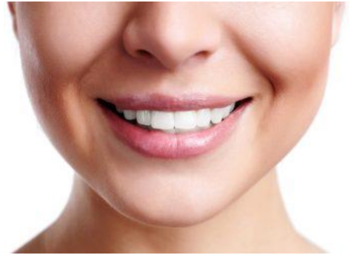
Close up relaxed smile