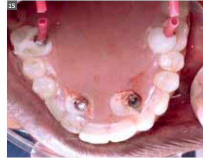
Acrylic-material intra-oral pick up