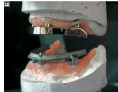
For the final fixed bridge, Straumann® CARES® Bars are used as a framework