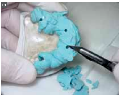
10 Trimming of impression material in the dental lab, the holes on the study model now represent the implant positions