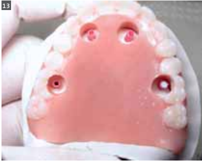
After trimming, fixed bridge prepared for intra-oral pick up as well as check of passivity and fit on study model