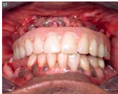
Interim fixed bridge, post-operative, facial view: note buccal flange extension, adaptation to maxillary ridge, and relation to mandibular natural dentition