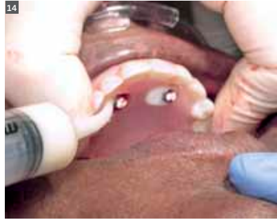
Screw channels of Titanium Copings blocked out, access and passivity in the patient's mouth verified