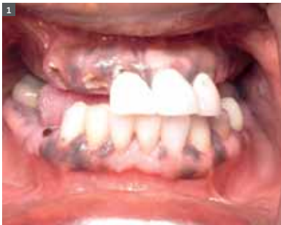
1 Pre-operative situation

Initial situation: A female patient presented at the dental office with a problematic screw-retained bridge restoration in the anterior maxilla. Based on her dental history it was decided to restore utilizing a fixed restoration on 4 implants and an immediate temporary prosthesis.