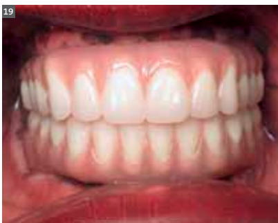
4 months later, the final fixed bridge is delivered to the patient