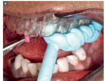
9 Blu-Mousse® application to identify the emergence of the Titanium Copings as well as preparation for pick up