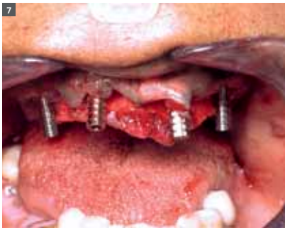
7 Titanium Copings, non-engaging, placed intra-orally, facial view