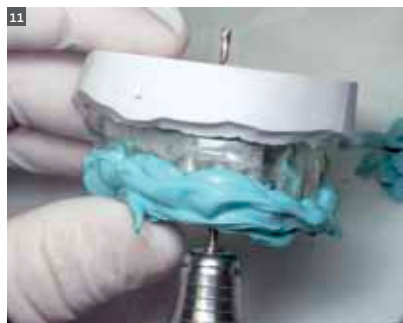
11 Study model drilling and registration