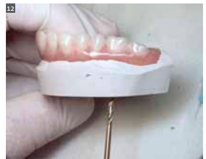
12 Interim fixed bridge registration with study model