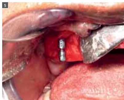
5 Straumann® BL RC Implant with SLActive® surface placed at #4 after bone ridge reduction