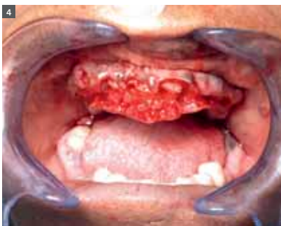
4 Flap and extraction of maxillary teeth