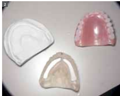
2 Study model, surgical stent and interim fixed bridge prepared by the dental lab