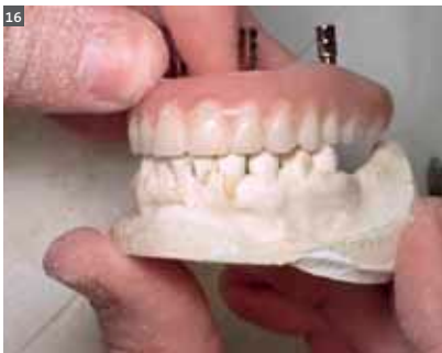
After trimming of fixed bridge, another fit check of study model