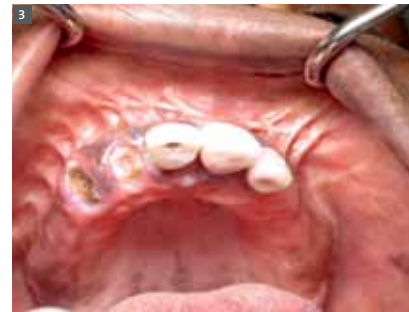
3 Anterior maxilla occlusal view